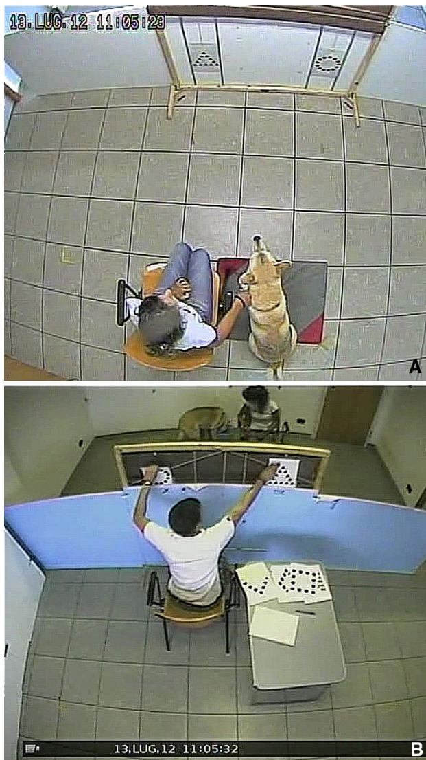
Fig. 1 Video stills: a front part of apparatus during presentation of two stimuli in discrimination phase; dog is gently restrained by operator in starting position; b back of apparatus during inter-trial interval, with operator preparing stimuli for next trial

characterised by a clear-cut two-level hierarchy and then tested them for their local/global preference in a visual discrimination test. As a further control on dogs' ability to extract information from local shapes, in the last phase of the procedure, the dogs were retrained to discriminate between two stimuli differing only at local level.